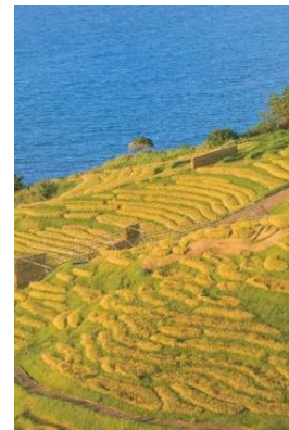
Stepped Rice Paddy