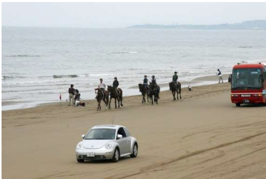
Chirihama Beach Driveway

A one-day technical tour to a local helicopter-related facility is planned, including visiting several traditional Japanese scenic places, such as the sand beach driveway, stepped rice paddy and Zen meditation class.